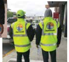
Ambassadors wearing their new JapantownSF gear!