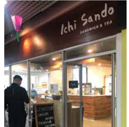
Ichi Sando serving Japanese style sandwich and tea.