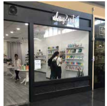
Day2Nite Glam a boutique specializing in beauty and skin care.

Business & property owners the new No Trespassing (MPC25) sign has now changed from bi-annual to an annual sign. Please keep the current yellow No Trespassing signs up until June. Community Ambassadors will begin distributing the signs in the coming weeks. Japan Center Malls and Kinokuniya tenants will receive their signs from property managers.